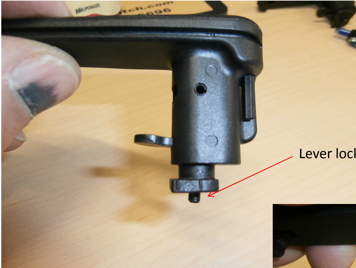
Lever locked, pin exposed